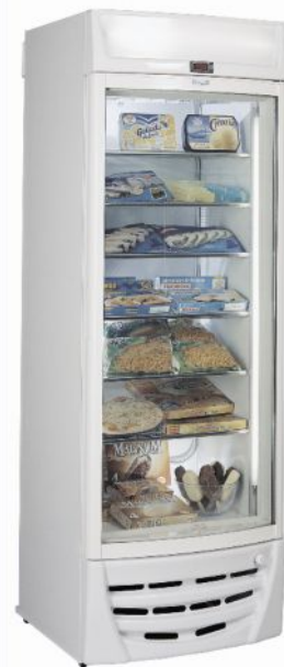
VCV-1V Single Door Frost Free Freezer