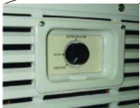
Side Grill Adjustable Thermostat