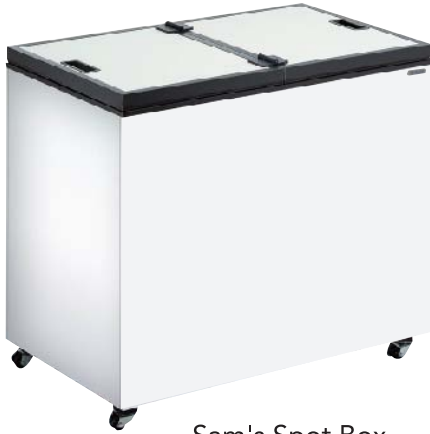
Sam's Spot Box