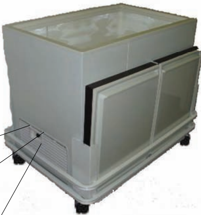
Cart Guard with Lid Holder