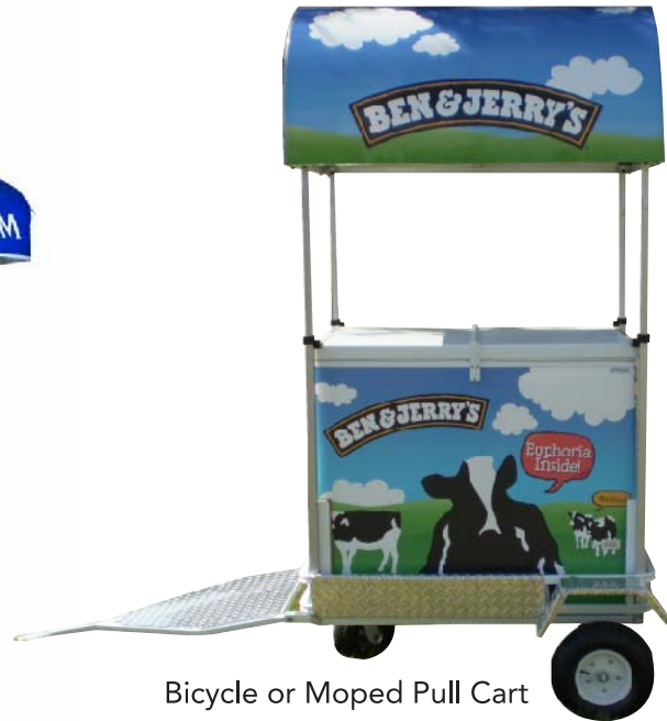
Bicycle or Moped Pull Cart