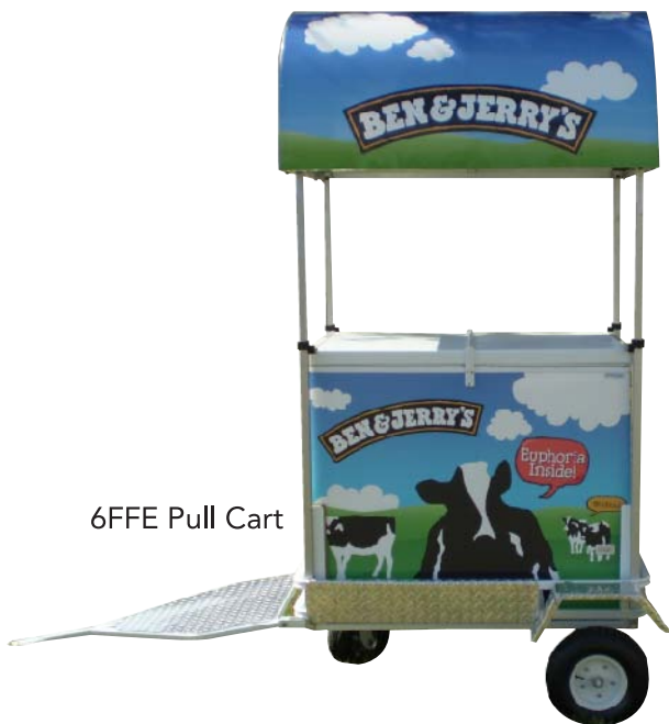
6FFE Pull Cart