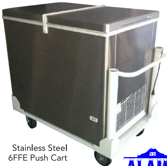
Stainless Steel 6FFE Push Cart

Description: Eutectic Cold Plate Push Cart Freezer